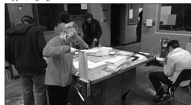
Middle School students hard at work in the Woodshop.